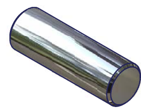
PIC D11-750 SCALE 2 : 1